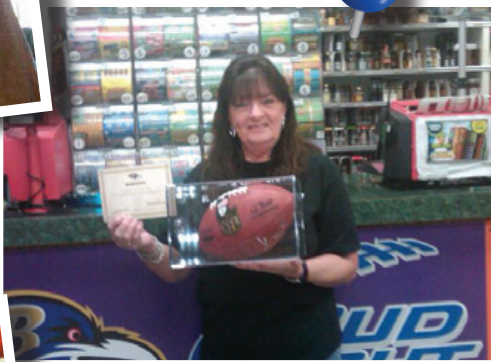
A Maiden Choice Liquors customer in Baltimore won an autographed Terrell Suggs football.