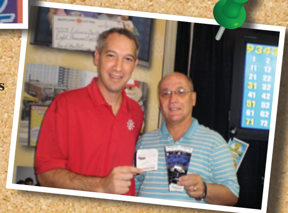
One lucky player went to a Ravens game, thanks to E-Z Convenience in Baltimore.

Advertise when you sell a winning ticket. It's a great way to increase your sales!