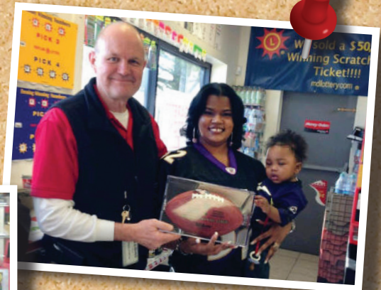
2 Go Convenience & Deli in Savage gave away an autographed Torrey Smith football.