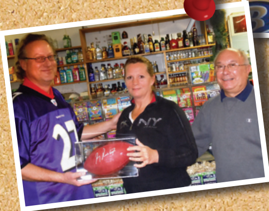
An autographed Ray Rice football was awarded at Brantwood Liquors in Elkton.